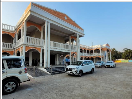
Government Shringi Rishi School, Nagri