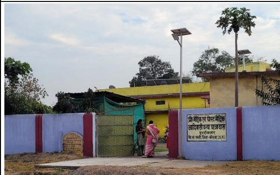
Adivasi Girls Hostel, Hardi Bazar