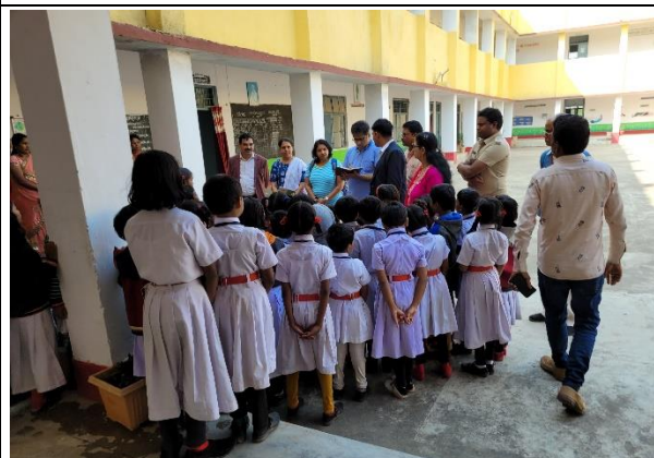
Model Adivasi Residential School, Dhamtari