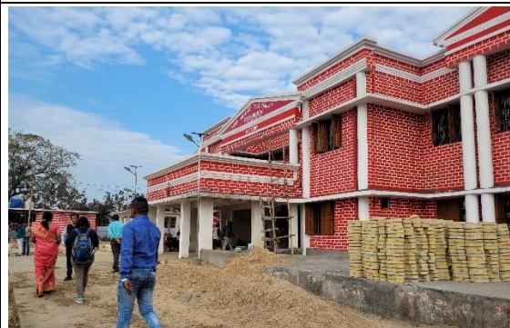
Composite School, Hardi Bazar