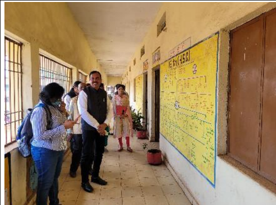
Government Higher Secondary School, Jamul