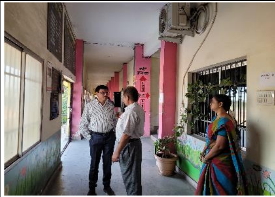
Government Higher Secondary School, Goganv