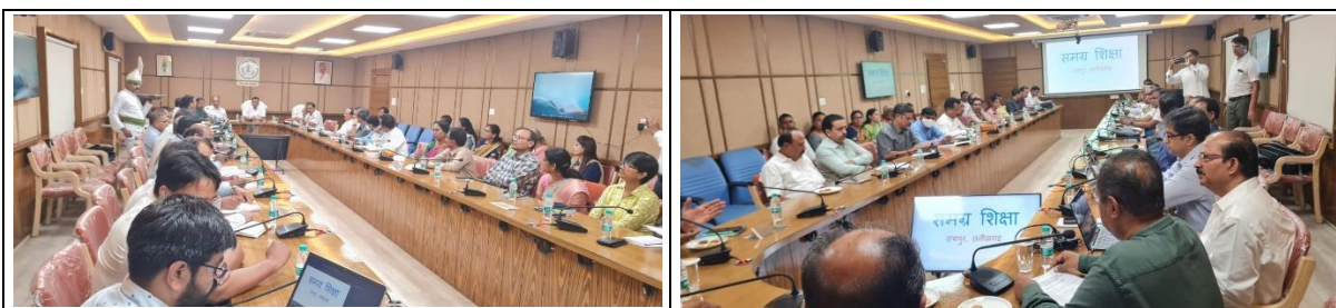
Photographs from the 1 st Multistakeholder Workshop with Government officials