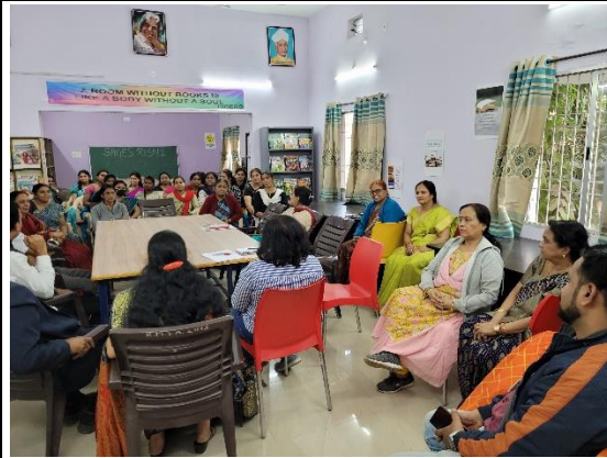
Government English Medium School, Risali